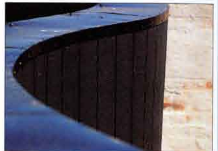
SHADOWclad façade at Blues Point Hotel, winner 2009 Special Judges Award Australian Timber Design Awards.